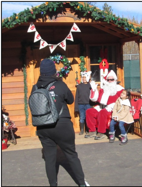
Kids sharing their wishes for Christmas.

What a great time we had! Families (of several generations), couples, singles, kids of all ages enjoyed seeing and conversing with him. His helpers handed out goodie bags and took pictures for people, so our visitors could go home and share the joy. And to make it EXTRA–special, the same group of singers (Big Bear High School) FOBBAZ delighted in at their holiday party came to the zoo to serenade everyone. The fun just never ended!