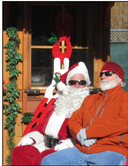
All ages loved chatting with Santa.