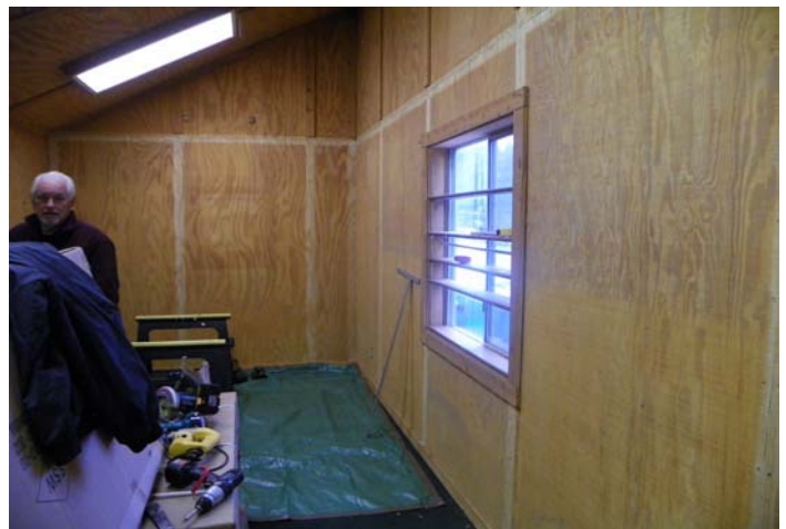
The Gift Shop, stripped down to bare walls