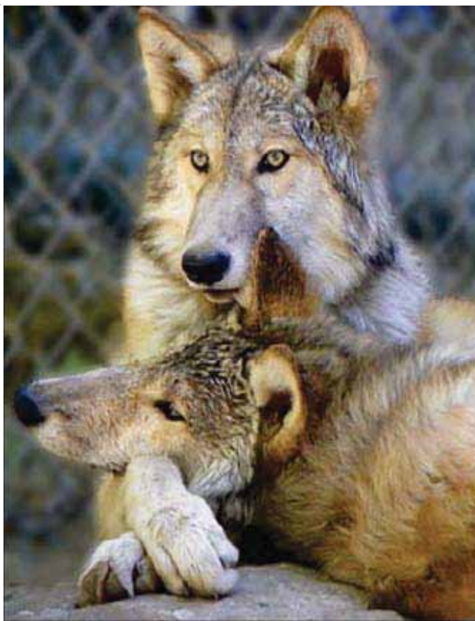
Wolf Pups, now fully grown

to develop a truly green park and think we might fit in all that’s in the original plans, even though at 14.5 acres that [the Discovery Center site] was larger. We want to make as much of the old design work as possible.”